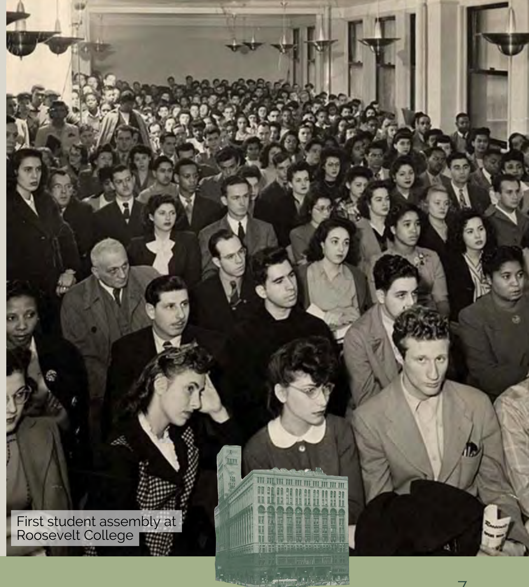
First student assembly at Roosevelt College

2010: Sustainability Studies program founded