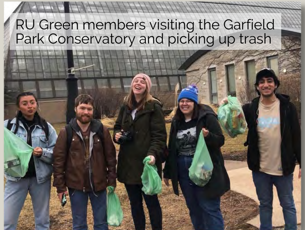
RU Green members visiting the Garfield Park Conservatory and picking up trash