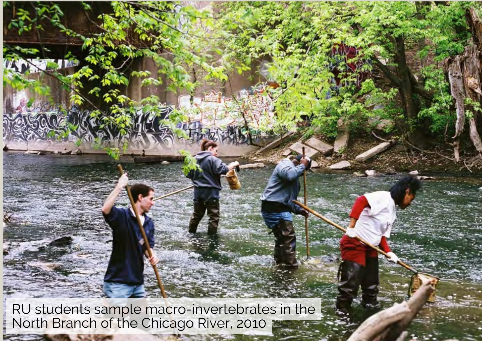
RU students sample macro-invertebrates in the North Branch of the Chicago River, 2010