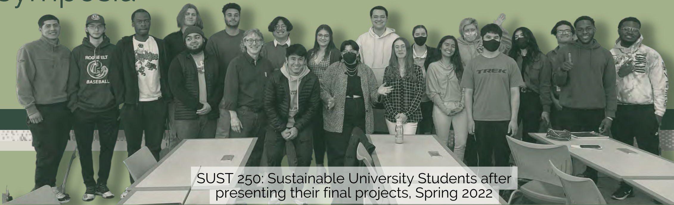
SUST 250: Sustainable University Students after presenting their final projects, Spring 2022