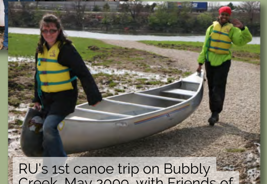
RU's 1st canoe trip on Bubbly Creek, May 2009, with Friends of the Chicago River