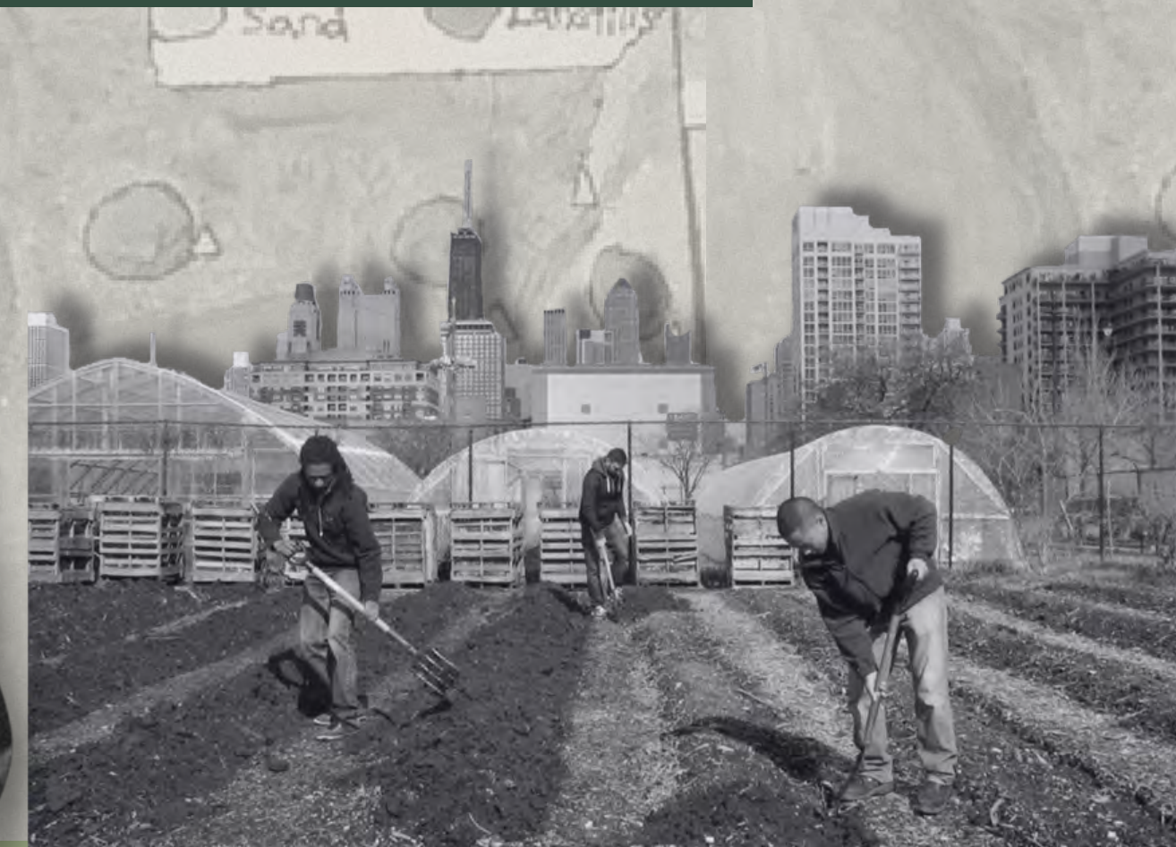
SUST 350 Service & Sustainability students work for the Chicago Lights Urban Farm, 2013