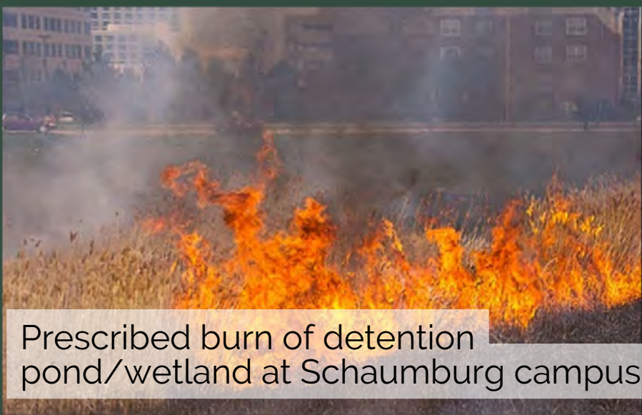
Prescribed burn of detention pond/wetland at Schaumburg campus

2022: Review and revision of Strategic Sustainability Plan begins