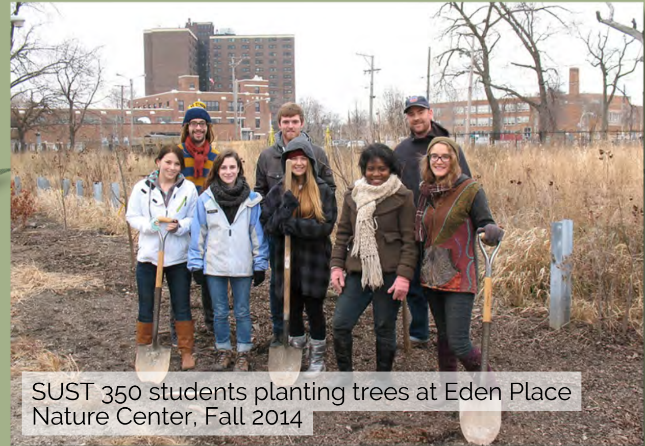
SUST 350 students planting trees at Eden Place Nature Center, Fall 2014