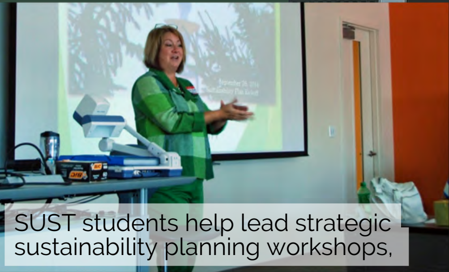
SUST students help lead strategic sustainability planning workshops,