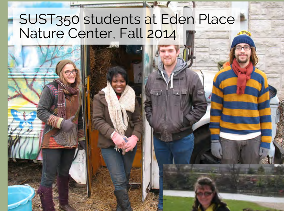
SUST350 students at Eden Place Nature Center, Fall 2014