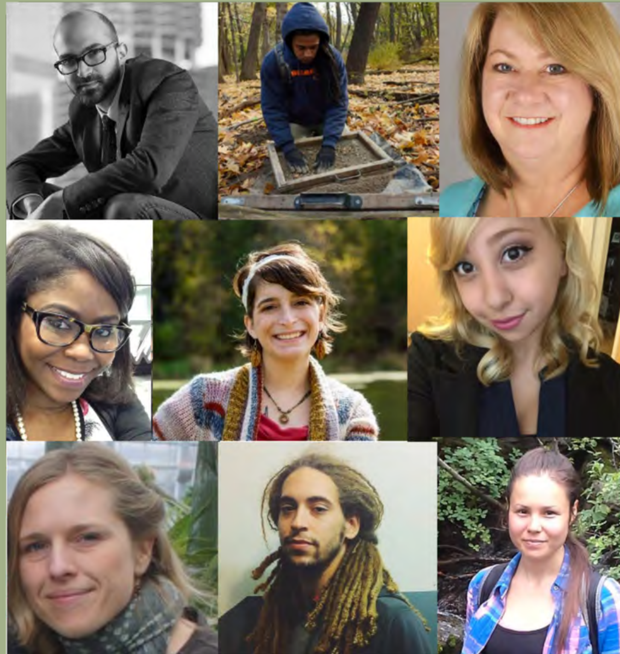
Selected SUST Alumni 2012-2018

SET THE AGENDA AT RU BY PARTICIPATING IN OUR FALL '22 SUSTAINABILITY PLANNING EFFORTS