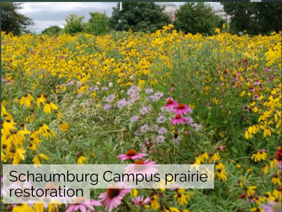
Schaumburg Campus prairie restoration