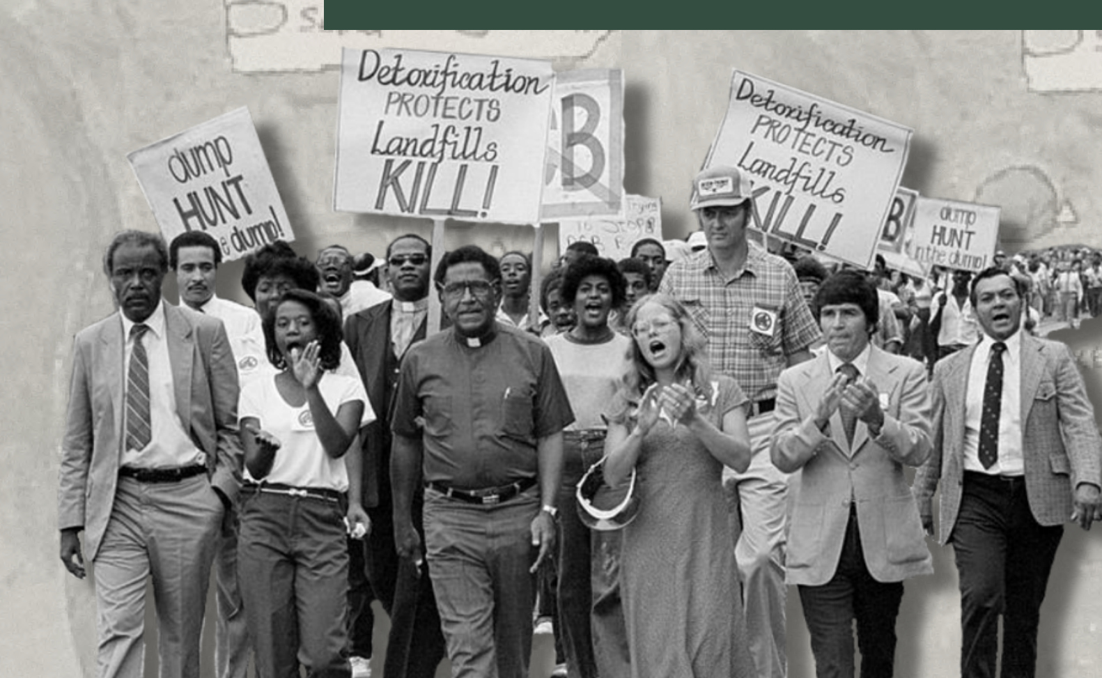
Protestors march against proposed toxic waste dump, 1982

Policies and practices that result in a higher likelihood of Black, Brown, Indigenous and low-income communities living next to hazardous waste sites.