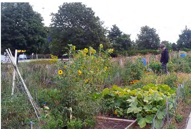
"RURbanPioneers" contribute to Soil Service Day 2013 by spreading compost in preparation for another community gardening season at the Schaumburg Campus.