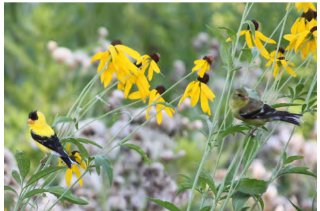
Biodiversity thrives in the naturalized prairie.