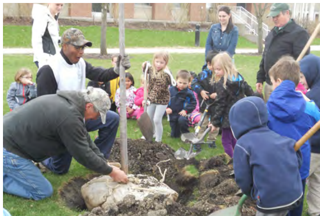
Bright Horizons Arbor Day Tree Planting Event—April 2014