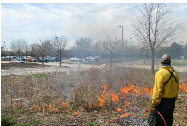
Spring 2015 Annual Prescribed Prairie Burn returns nutrients to the soil and removes invasive species.