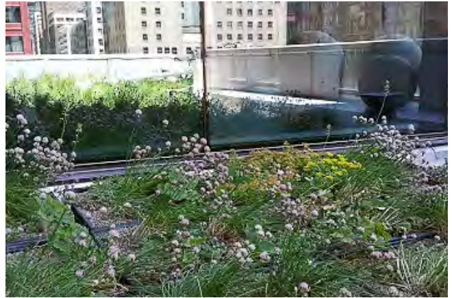
Tended by students and staff, the Wabash Building's rooftop gardens provide fresh food for the Chicago Campus dining center.