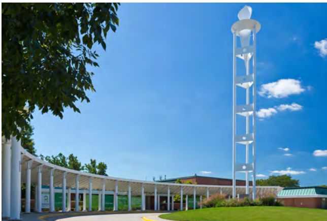
LED lighting retrofit at Schaumburg Campus.