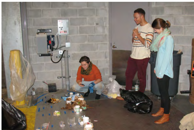
Roosevelt students in SUST 240: Waste & Consumption conduct a waste audit of the Auditorium and Wabash buildings in October 2014.