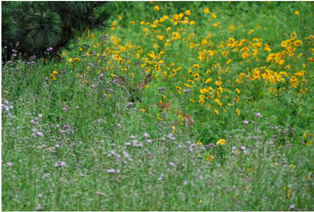
Native prairie provides educational opportunities and supports biodiversity in Schaumburg's urban center.